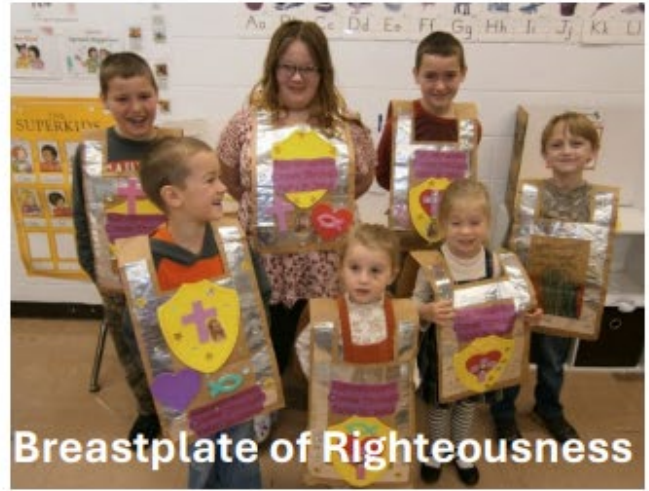
Breastplate of Righteousness