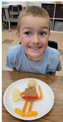
An edible craft was a summary activity for the armor of God lessons.