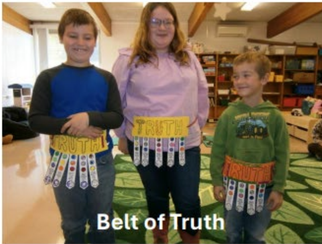
Belt of Truth

During each Armor of God lesson, the SSers fashioned their own piece of armor.