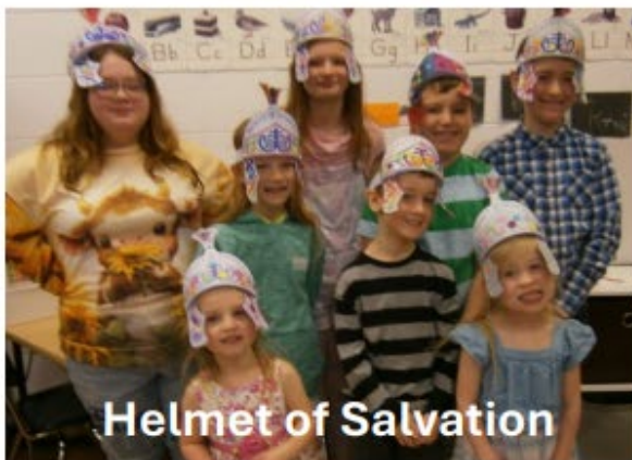
Helmet of Salvation