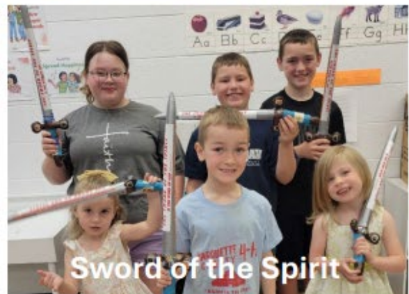
Sword of the Spirit