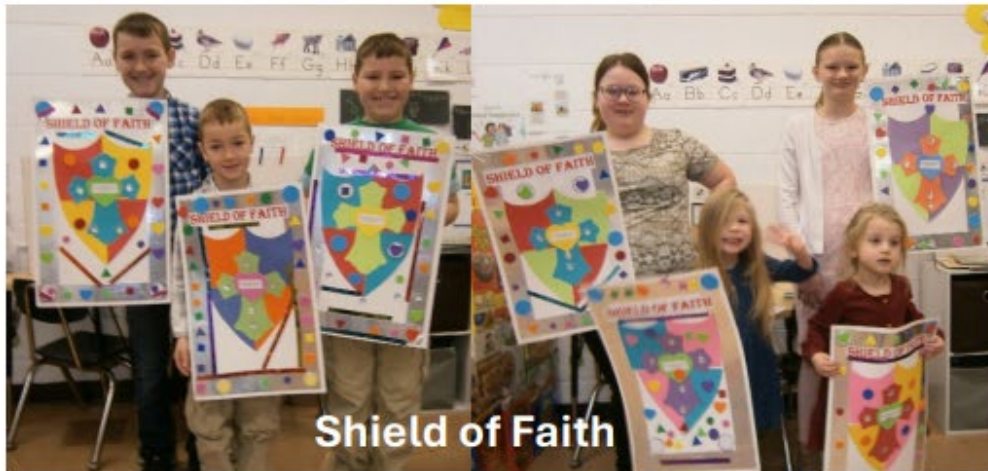
Shield of Faith