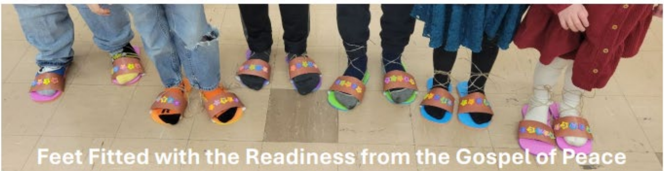
Feet Fitted with the Readiness from the Gospel of Peace